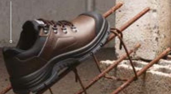
FLINT High & Low